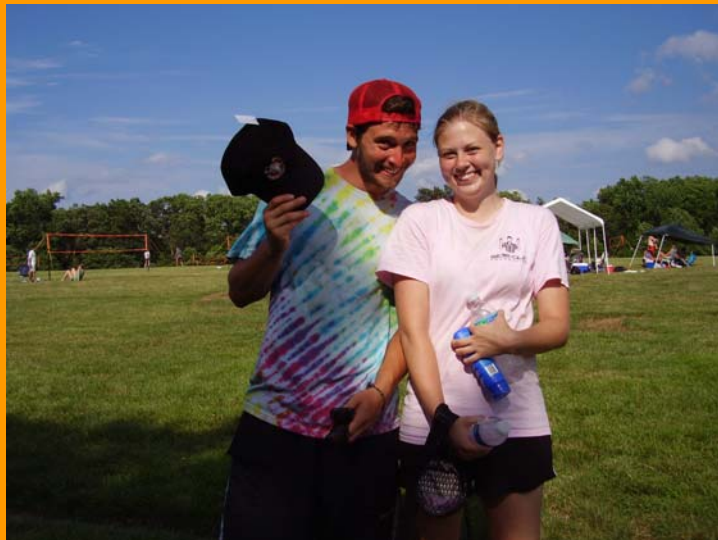
2 nd Place – Reverse Co-Ed Division